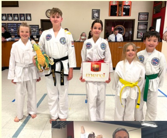
More pics from January 27: champs, grand champs, and, chili champs! And a few more pics next page....