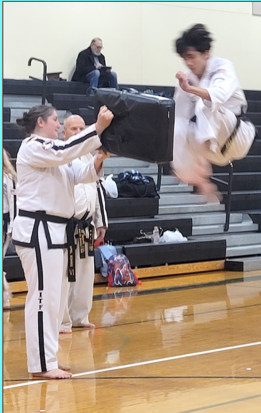
Second Runner-Up Image of the Year 2023