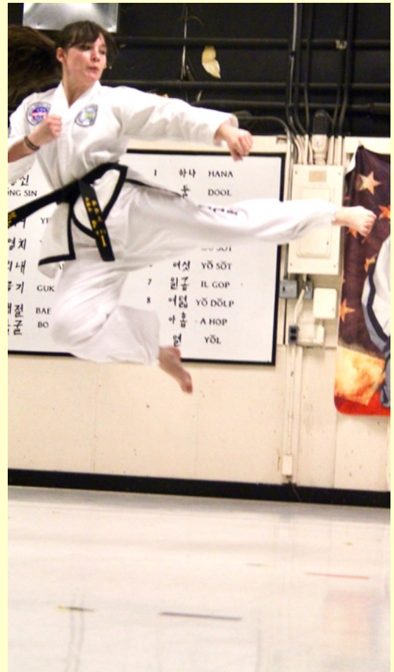
From the test March 9. A bit of basic kicks, a little ho sin sool, and on the next page, more.