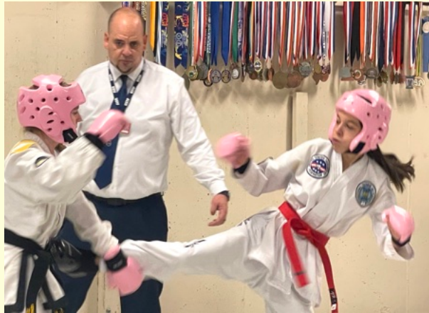
Some of the action from the Broomfield tournament.

December 9 at Sandy, Utah. Testing will be candidates from Dubbeld Taekwon-Do , Community of Grace Taekwon-Do , Ohdoilkwan Taekwon-Do , and Jeontong Taekwon-Do . Hopefully some copy and photos soon.