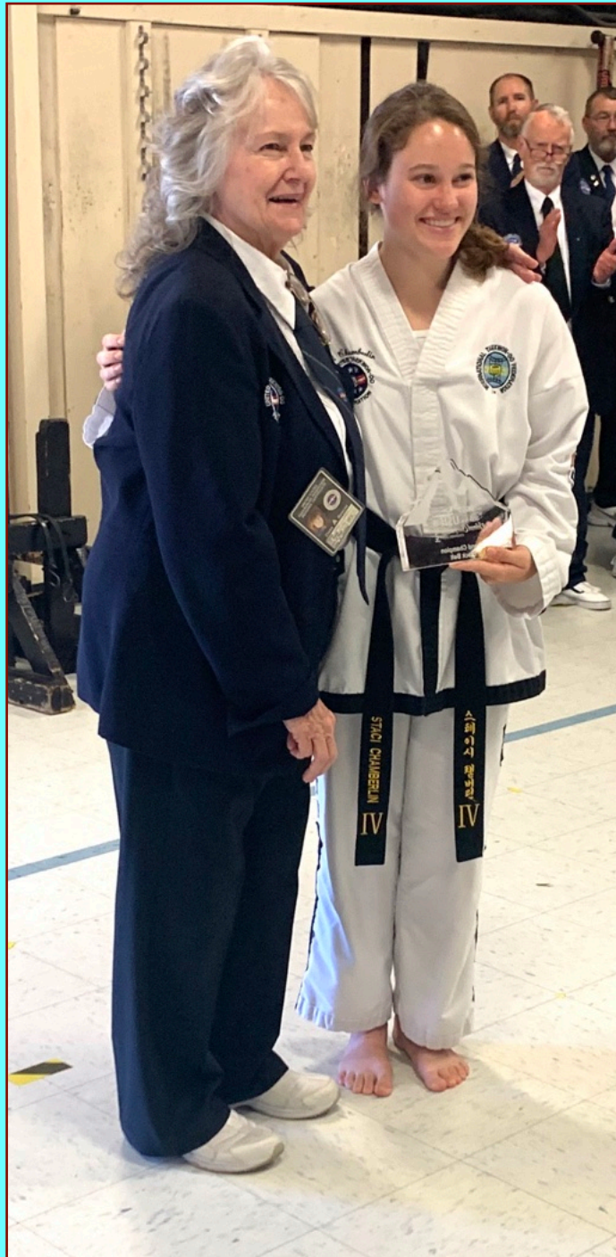
Third Runner-Up Image of the Year 2023