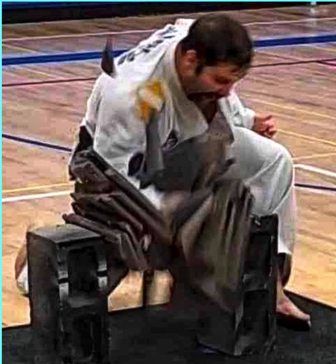
First Runner-Up: Image of the Year 2023