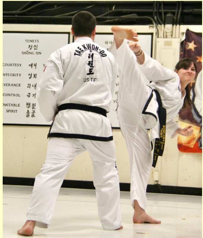
Also from the 9th, a bit of step sparring and a good looking cake (and some good looking Taekwon-Do practitioners).