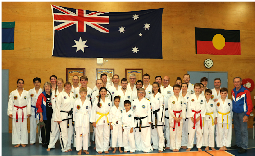
Among classes taught by USTF and Ba Rui instructors at the Ba Rui Camp.