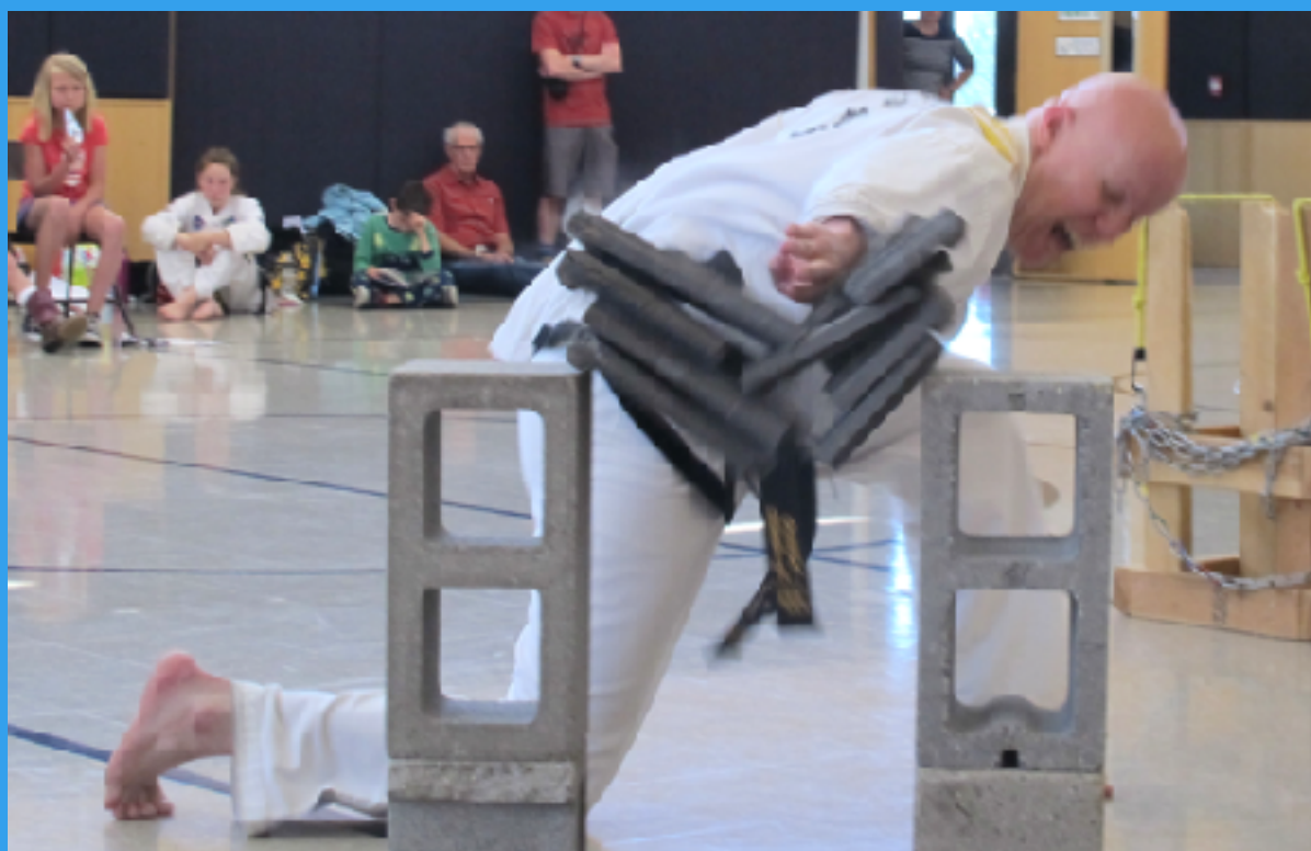
Waterfalls popular, breaks as always, high kicks, kids having fun.