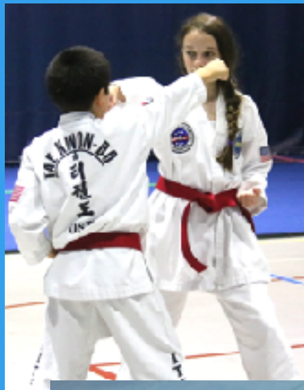
Ho Sin Sool routines, past echoes, effort and exhaustion.