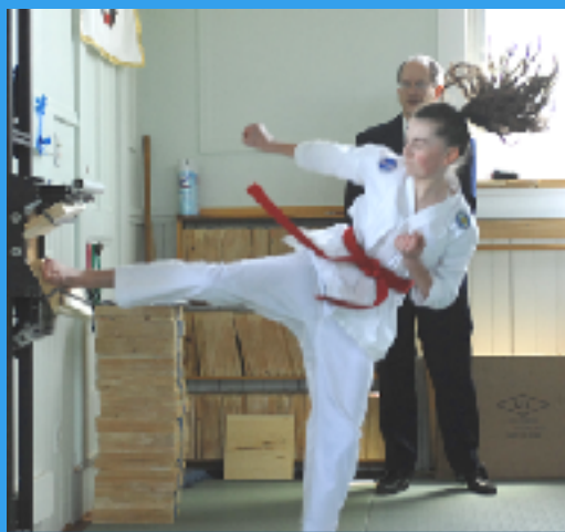
Great pics, great contributions.