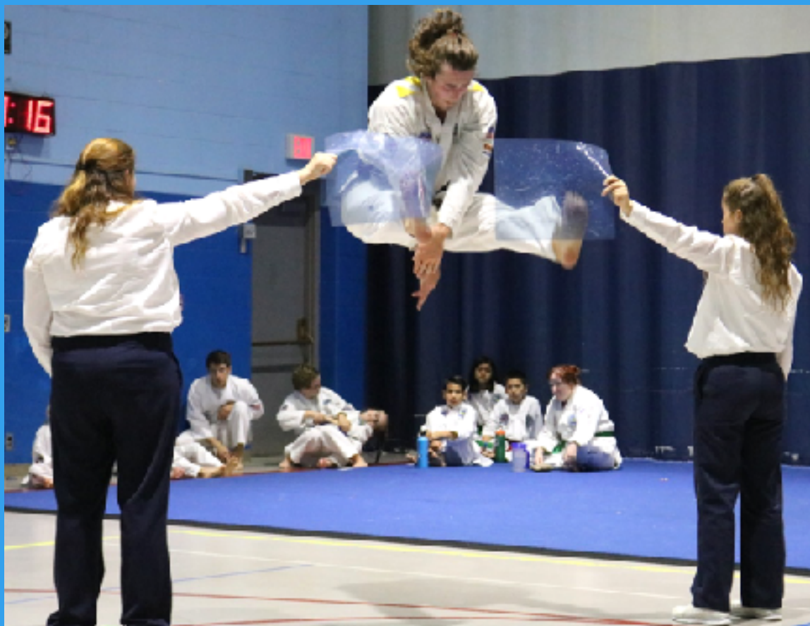
Love of our Art