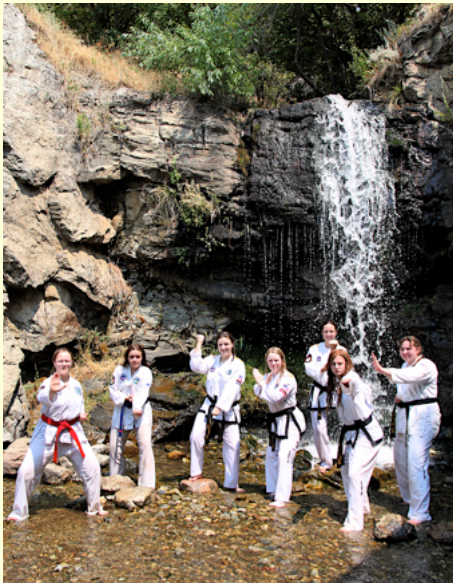
Photo: the ladies in attendance and a waterfall.

Many participants look forward to this event every year, and this year's camp lived up to high expectations. We are already eagerly looking forwards to next year's camp!