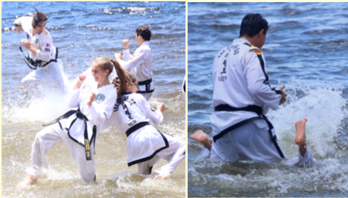
Training at the lake; good practice for submarine warfare!