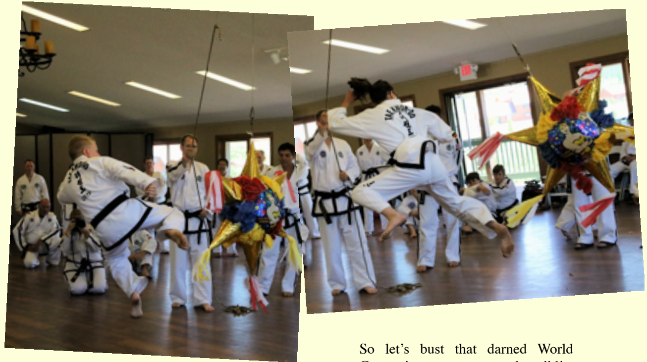
So let's bust that darned World Camp pinata; oops, guess they did!