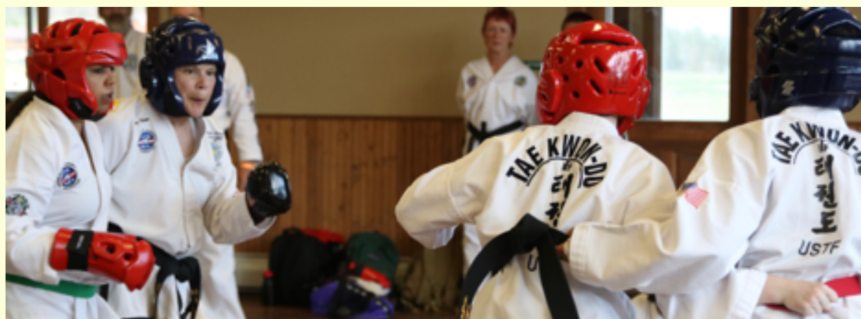
Siamese sparring at world camp, featuring teams of both even and uneven sizes.