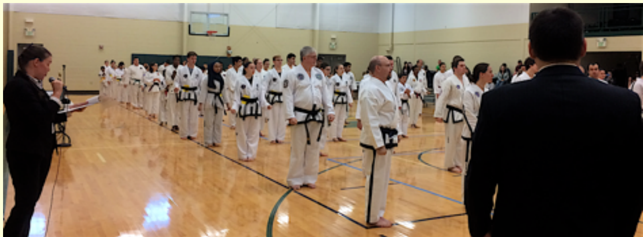
Lining up for the AAMA Spring Classic. See pages 7 & 8.