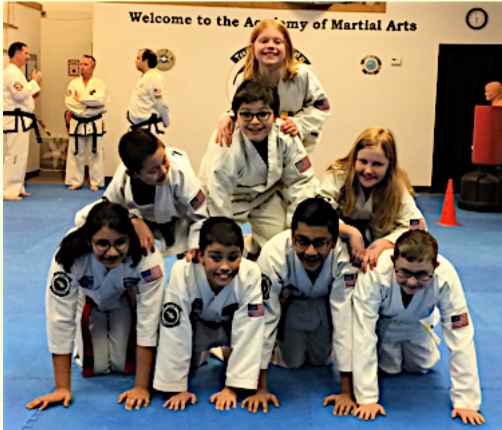
The Study of Taekwon-Do: Absolute Seriousness At All Times

The 11th Annual Axe Taekwon-Do Tournament will be held at Axe Taekwon-Do, Bellevue, Nebraska, on April 21. Should be an awesome event.