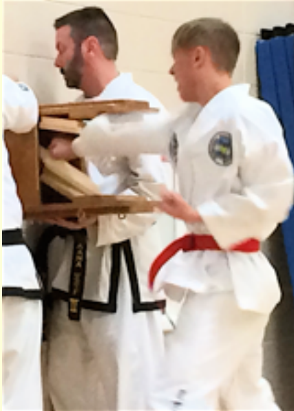
Statements made about the power of Taekwon-Do, April 30, Sheboygan Falls.