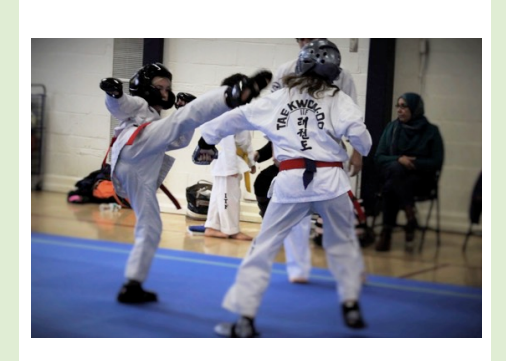
SUNDAY, March 5<sup>th</sup> 12:30pm

COMPETITORS ALL AGES, ALL RANKS REFEREES ALL AGES & CLASSES Jumping Contents, Patterns, Sparring, Breaking