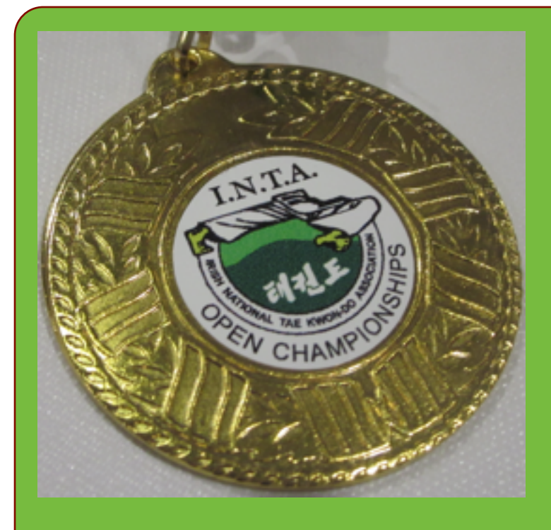
Irish Nationals images.