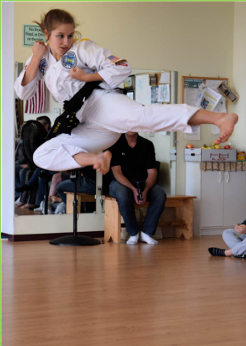
2016. A good year. Some great pictures.