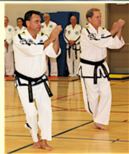
A bit more action from the September 16 test in Sheboygan Falls.