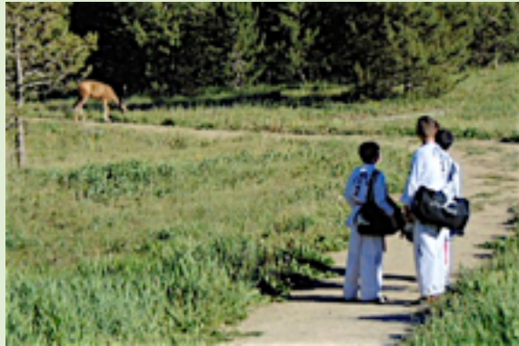
Top left: "Hey, that dude's not in dobok!" Top right: "Glad that tree's being held up." Middle: "Working up a