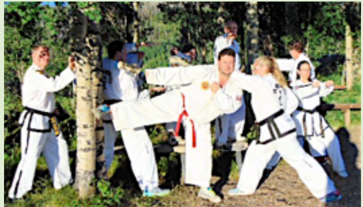
REAL sweat." Bottom: "Straighten those lines!"