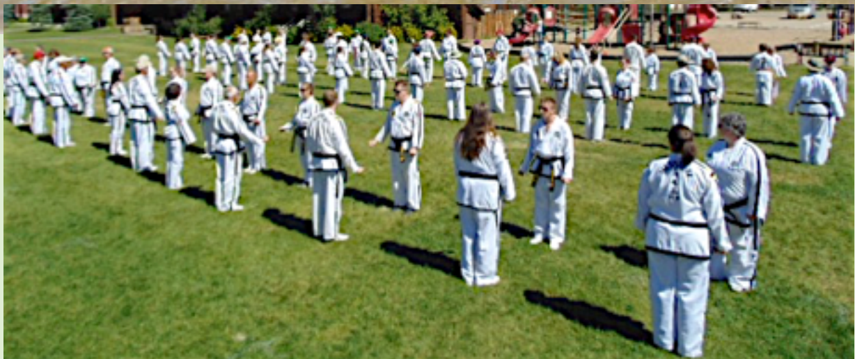
More World Camp Photos will be in the October issue of the Flash ..