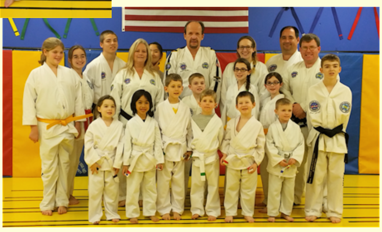
A USTF Referee Course was held at Rock Springs, Wyoming, January 31. Hopefully some more info on that in the next Flash.