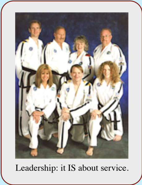
Leadership: it IS about service.

In characteristic self-effacing fashion, her remarks upon receiving the award were modest and to the point. “I’m honored, thank you, but I want you all to know that giving to Taekwon-Do is not hard when you think of all Taekwon-Do has done for us. There is satisfaction in telling the story, and each of you has one and should consider sharing the news, again and again.”