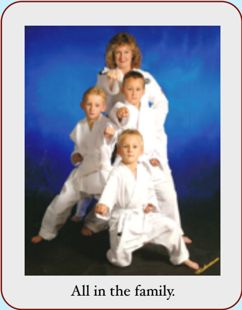
All in the family.

In Taekwon-Do, the resume’ doesn’t quit. She’s been at it since 1971 and was the first woman on the ITF Board of Directors as of March 1986. She has worked international Games as an “A” Referee, is an “A” Instructor, and has organized World Camps and USTF National Tournaments for many, many years. She has taught around the world (New Zealand, Australia, New Guinea, many others) and demonstrated in many more countries. She is the “Iron Lady” at Headquarters, answering questions, putting out fires, and keeping our potential chaos somehow looking smooth. She has given Taekwon-Do her time, skill, grit, intelligence, and love.