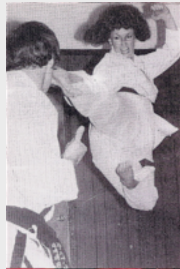
A fierce competitor.