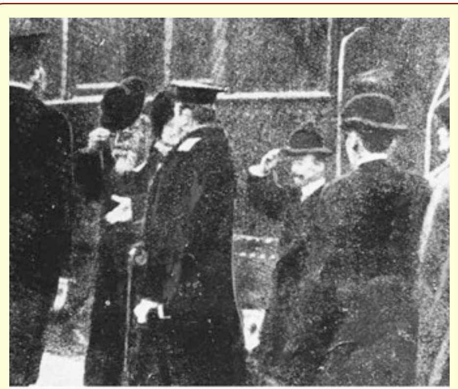
Hirobumi Ito, second from left, steps from the train in Harbin Railway Station, on Oct. 26, 1909. A few minutes later, he was killed by young Korean independence fighter Ahn Jung-geun.

The assassination of Ito by Ahn was praised by Koreans and many Chinese as well, who were struggling against Japanese invasion at the time. Well-known Chinese political leaders