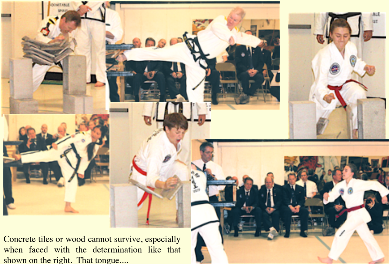
Concrete tiles or wood cannot survive, especially when faced with the determination like that shown on the right. That tongue....