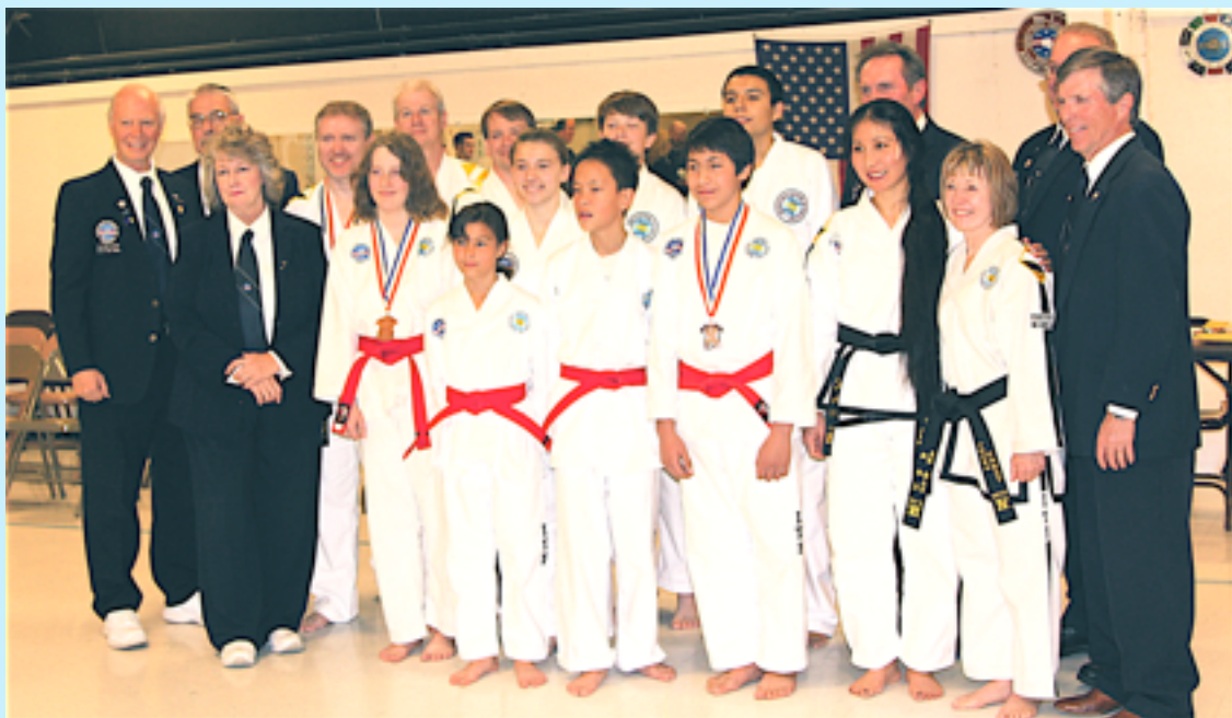
The March 15 Dan test group and Board. Congratulations!