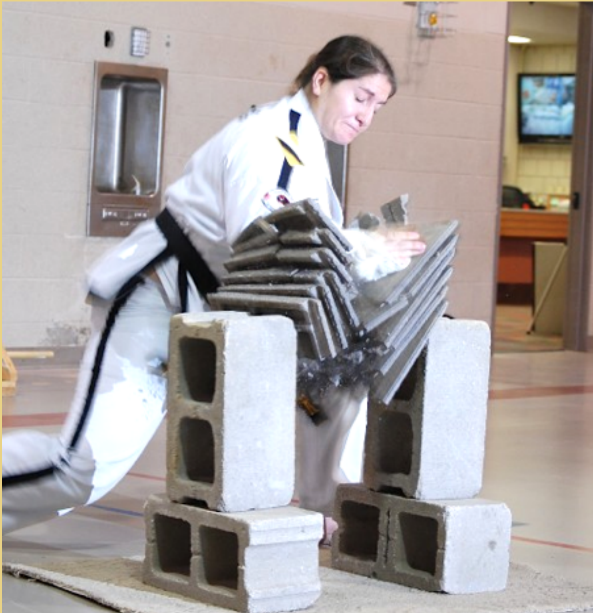
Fifth Dan April Bowing leaves no doubt.

On February 22 it is rumored there will be A USTF Referee Course at Sereff Taekwon-Do.