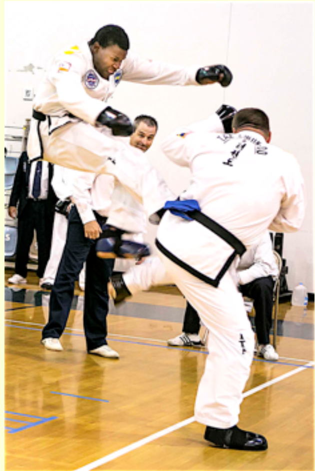
Above left: walk in on me, will ya? Above right: two kicks airborne? Dare ya to do THAT again! Lower right: OK, you asked... Low left: the future.