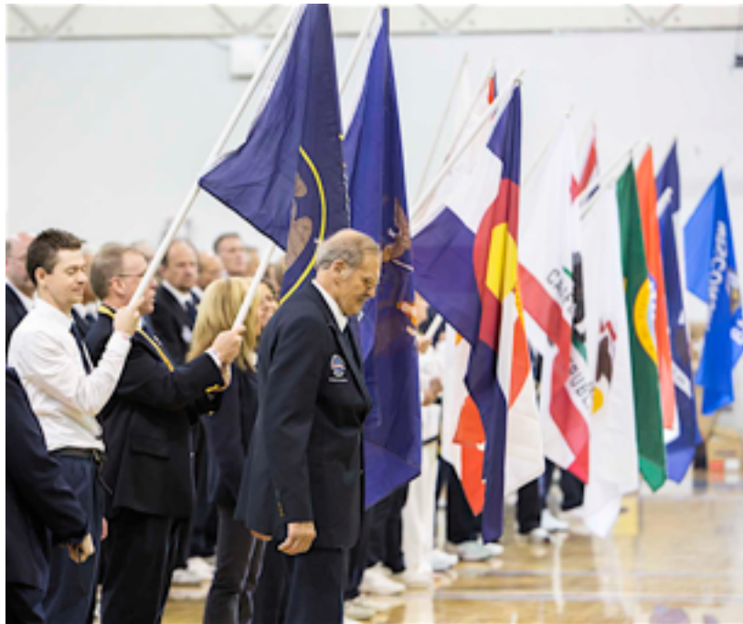
In contemplation of our nation's flag.