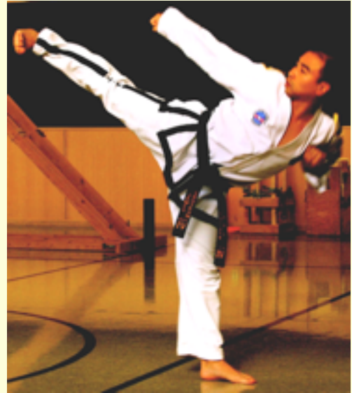
Side piercing kick with style!