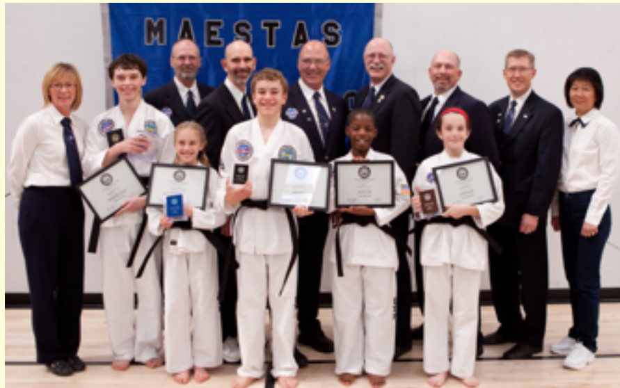
The Board & the Candidates: Region One Black Belt testing November 17.