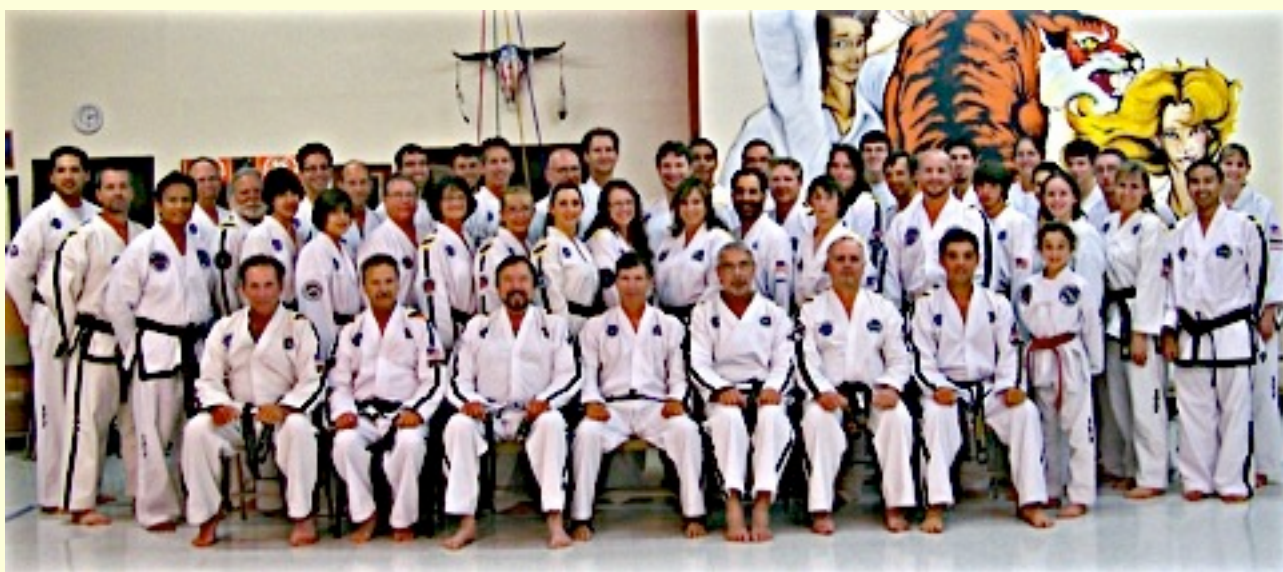
Participants (with Instructor dead center) in the USTF Class C Instructor Course .