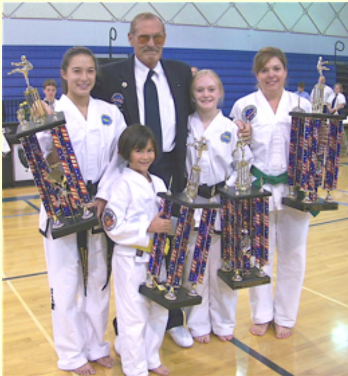
Photo below: The Grand Champs, a Gender Sweep! Bringing home the metal goods and posing with the Sr. Grand Master. Could it ever be better?