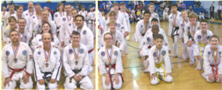
Photos. Above left, Adult Breaking Team Winners. Right, Junior Breaking Team Winners.

On October 29, at Crystal Lake, Illinois, a combined Black Belt testing was conducted at the School of Classical Taekwon-Do and The