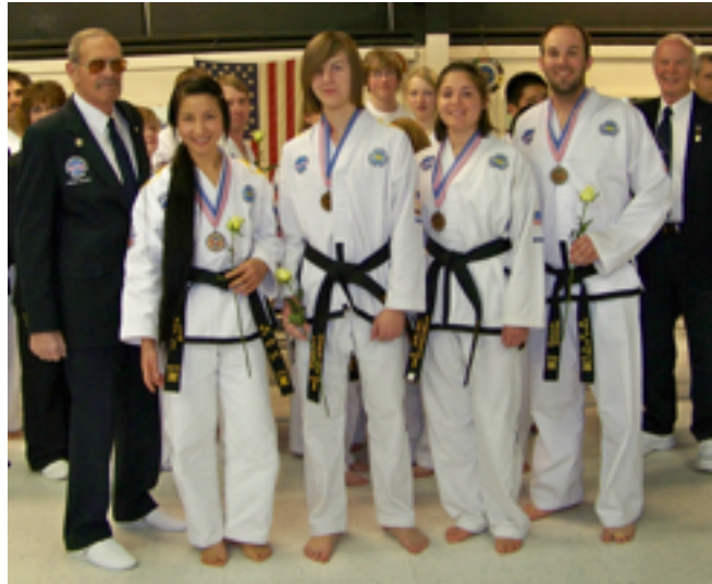
Group photo of the Black Belt testing held March 13. (See article above.)