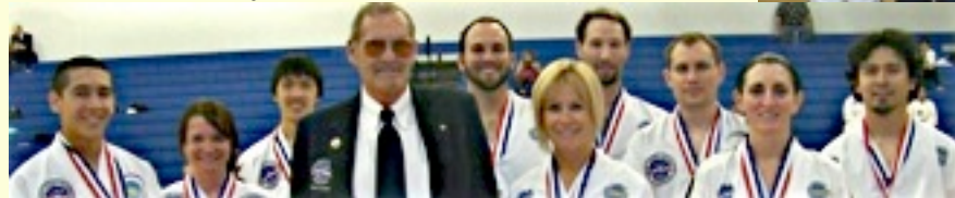
Team Grand Champions, Sereff TaeKwon-Do, with "the Boss".