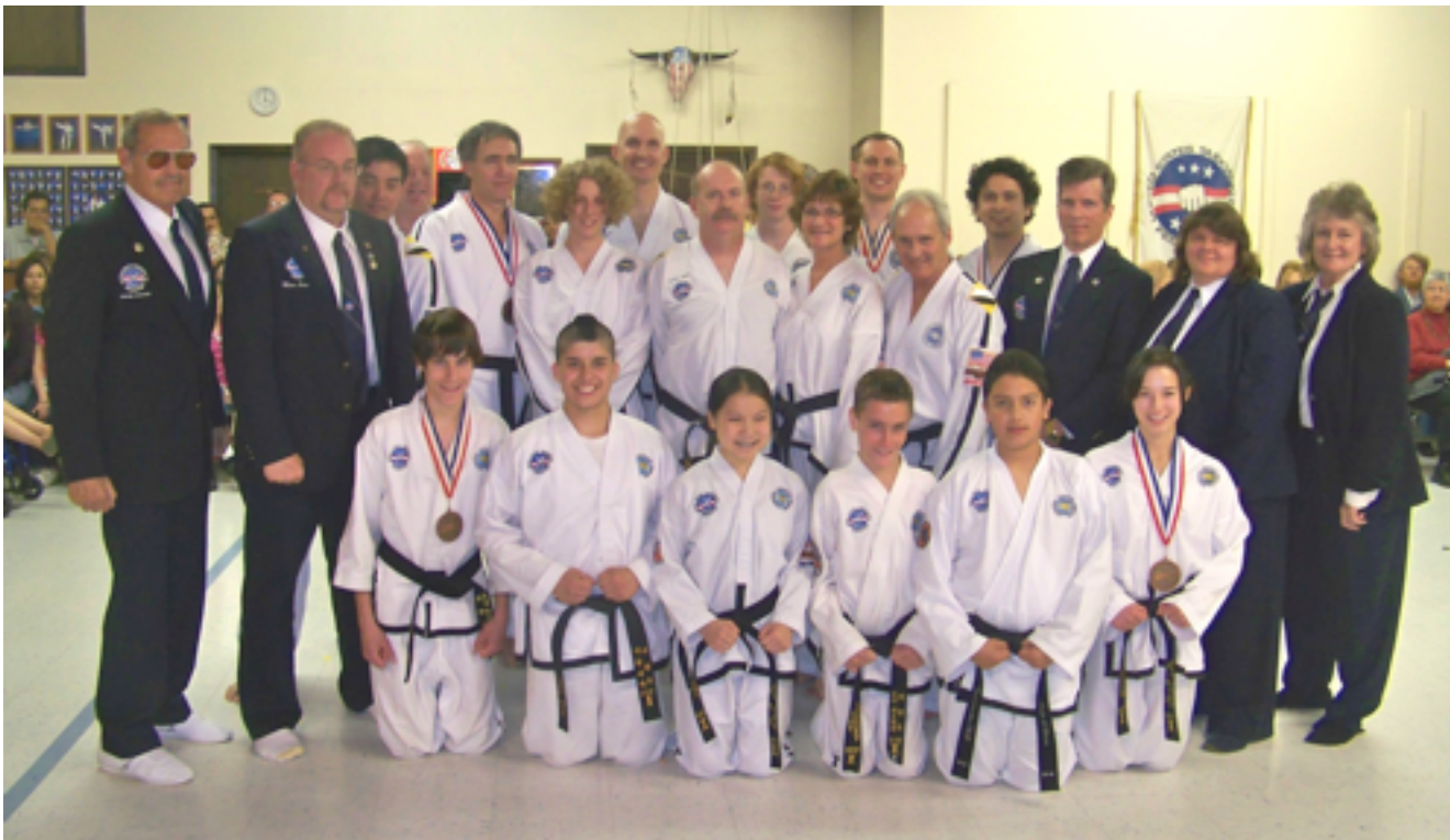
Students and Instructors at a Black Belt Testing, Broomfield CO, March 28.