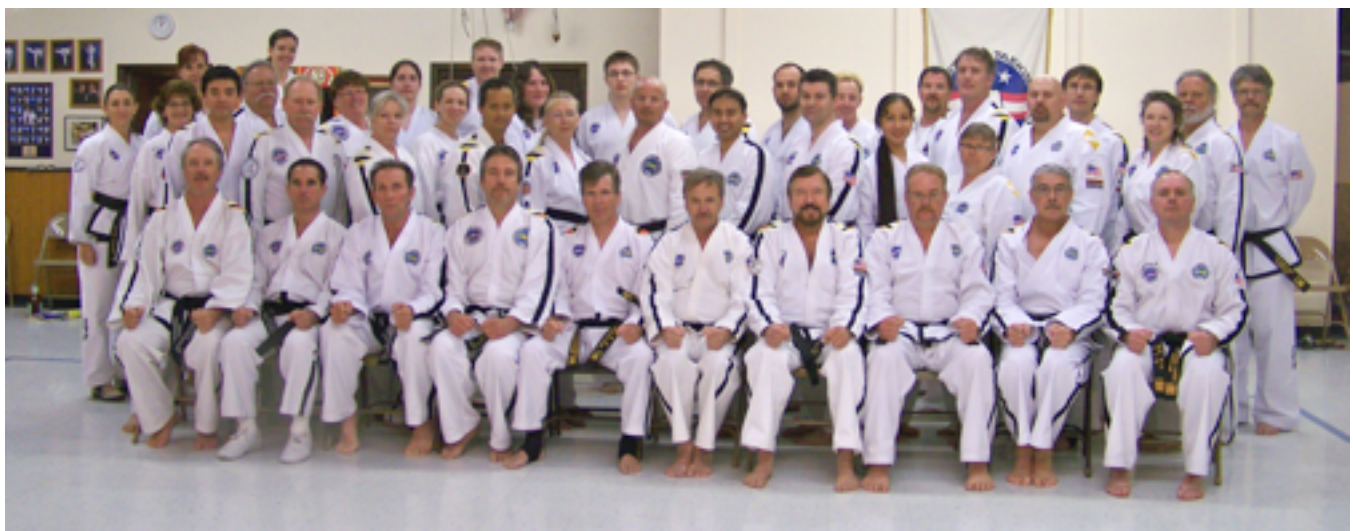
Instructors gathered for the Class B Instructors Course at Broomfield CO on April 25 and 26.

Date, place, nature of the event, name of event (“The Third Annual Bull-baiting Tournament”), contact name and e-mail or phone or both. And anything else you want us to mention.