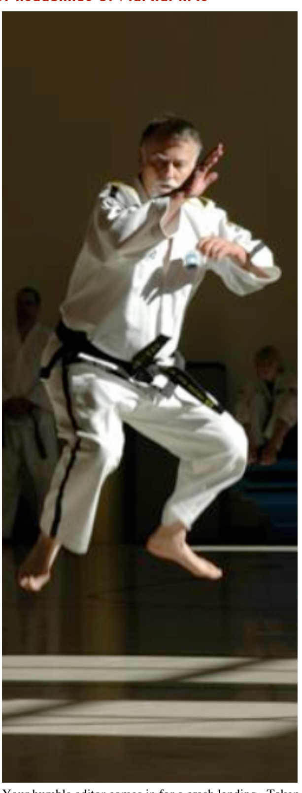
Your humble editor comes in for a crash landing. Taken microseconds prior to completion of knifehand guarding block.